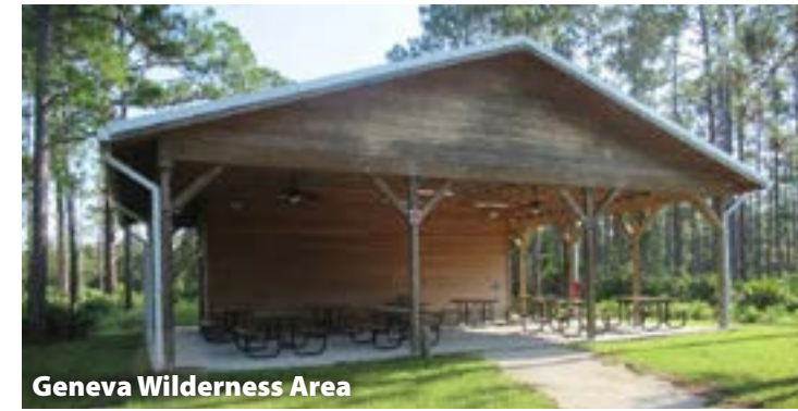
Geneva Wilderness Area

For more information, please call the Geneva Wilderness Area at (407) 665-2211