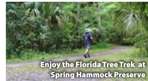
Enjoy the Florida Tree Trek at Spring Hammock Preserve