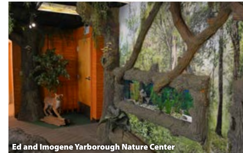
Ed and Imogene Yarborough Nature Center

For more information, please call the Geneva Wilderness Area at (407) 665-2211 or email nswanson@seminolecountyfl.gov .