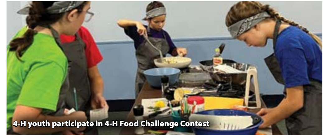
4-H youth participate in 4-H Food Challenge Contest

If you have questions about your home, landscape, or farm, or want to discover more about pesticide licensing, food safety, nutrition, or 4-H youth development programming, UF/IFAS Extension Seminole County has solutions for you. Expert Extension Agents provide research-based answers through a variety of programs and services. Check out an online webinar or workshop, register for a special event, or set up an appointment for ongoing services.