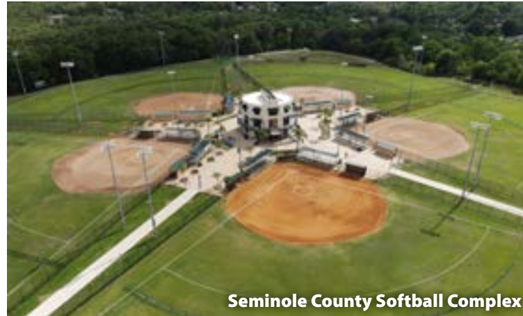
Seminole County Softball Complex

Free of charge; Balls available in-office. First come, first serve. Open dawn to dusk.