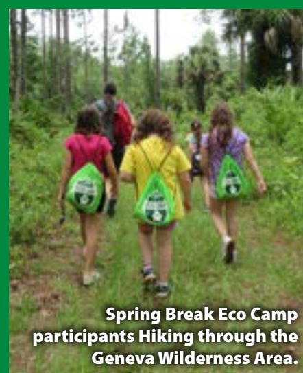
Spring Break Eco Camp participants hiking through the Geneva Wilderness Area.

Cost: $132 (extended day available, 7:30 a.m.-5:30 p.m., $15/camper)