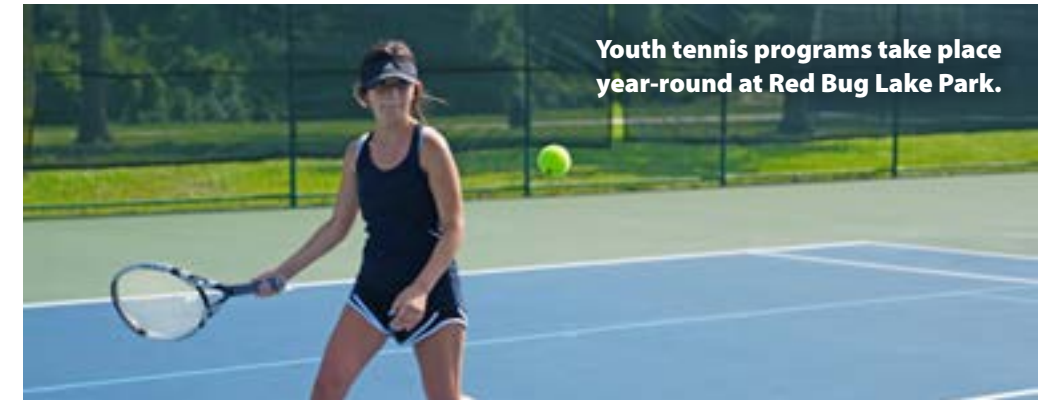
Youth tennis programs take place year-round at Red Bug Lake Park.

$36 (Saturday group lessons held one hour per week for 4 weeks)