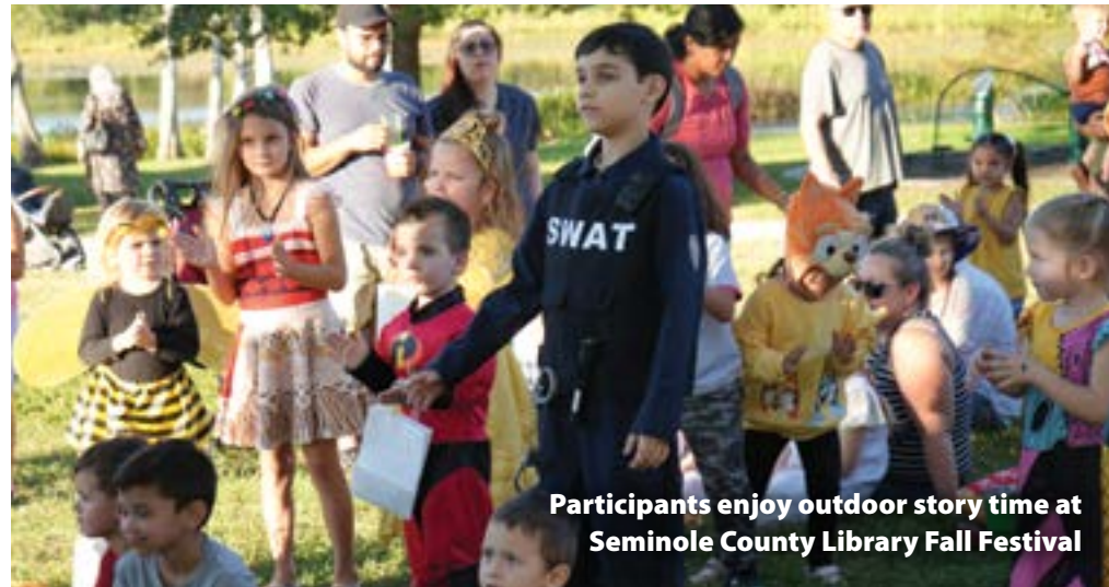
Participants enjoy outdoor story time at Seminole County Library Fall Festival

Central Branch (Casselberry) One Monday per month, 10 – 10:30 a.m.