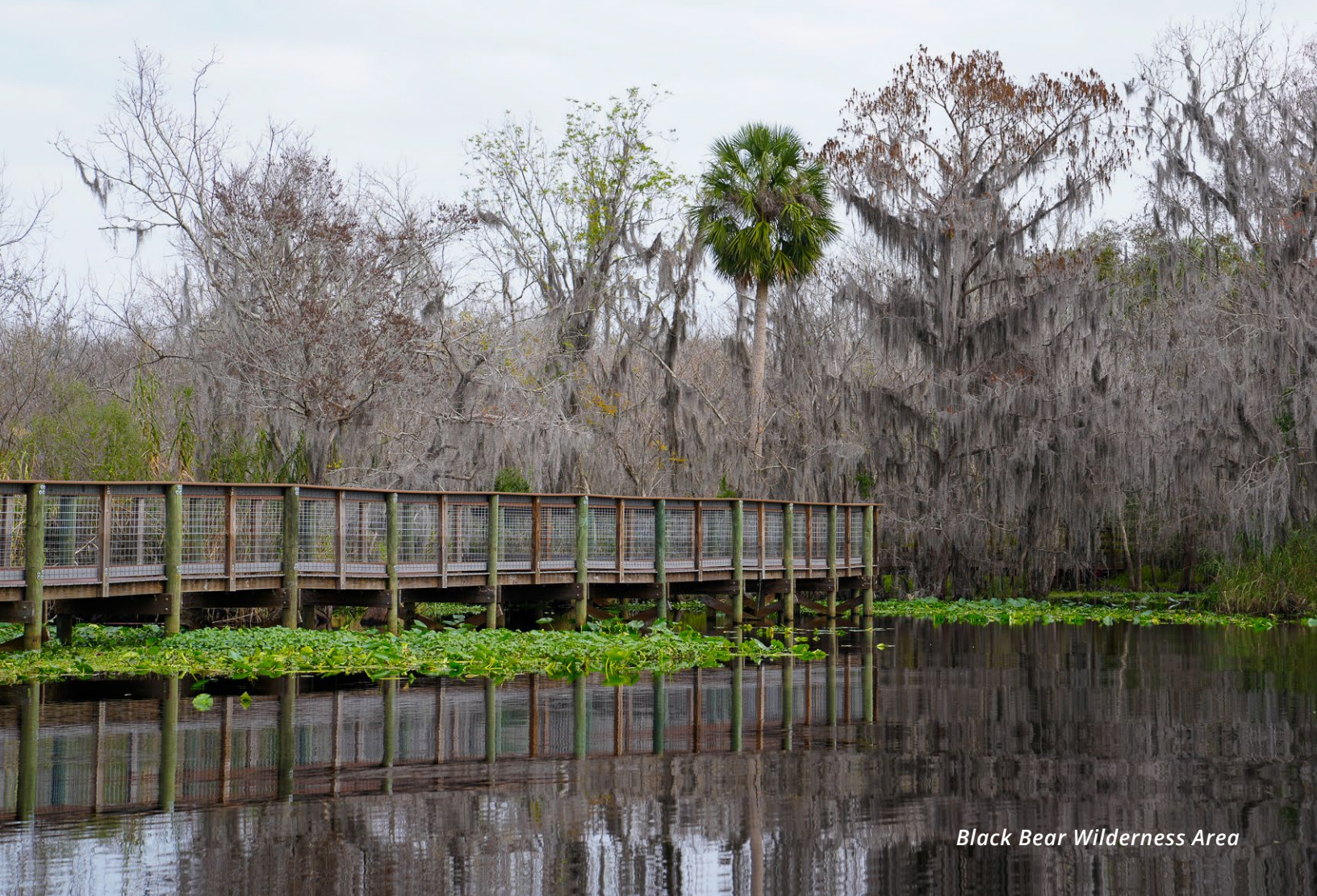
Black Bear Wilderness Area

SEMINOLE COUNTY PARKS AND RECREATION DEPARTMENT EXTENSION SERVICES | PARKS AND TRAILS | LIBRARIES | RECREATION