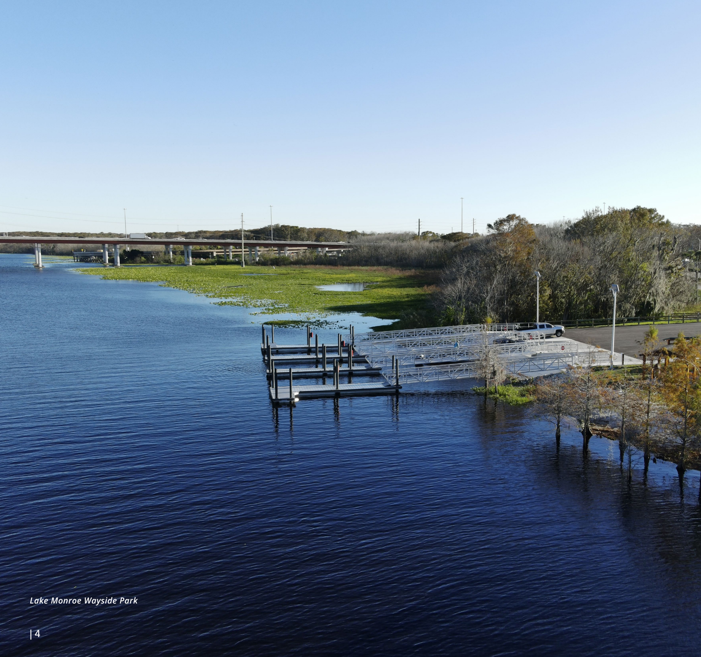
Lake Monroe Wayside Park