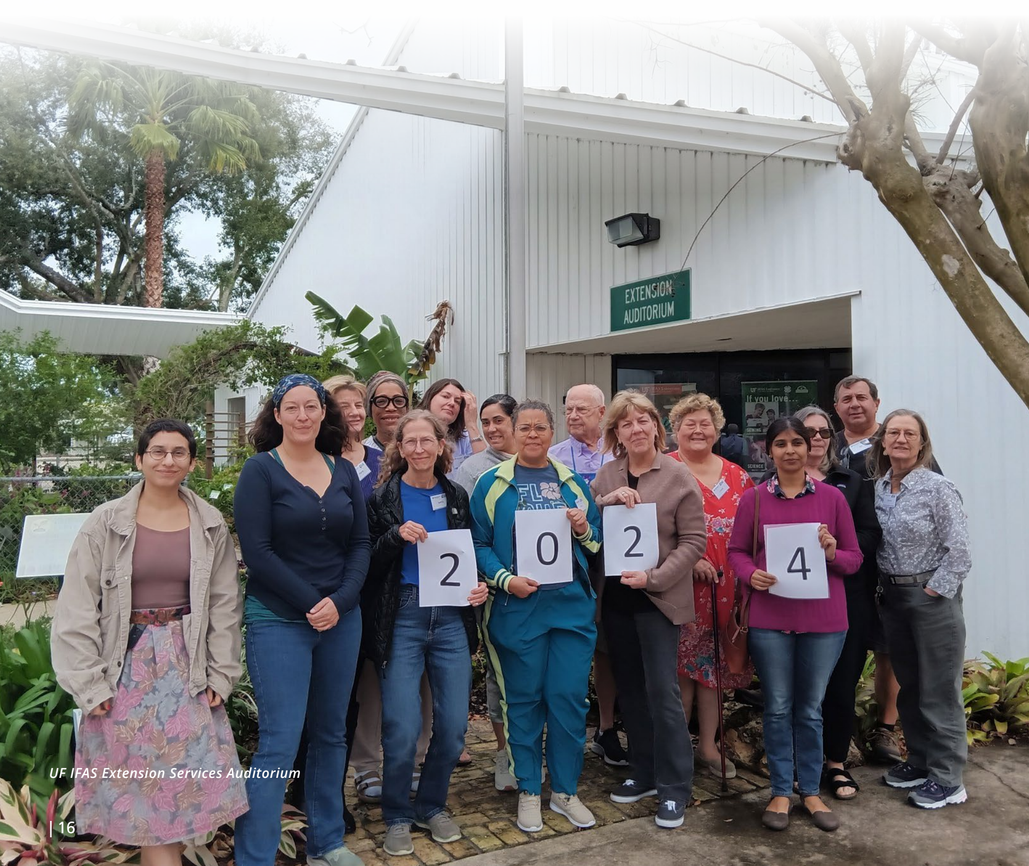
UF IFAS Extension Services Auditorium