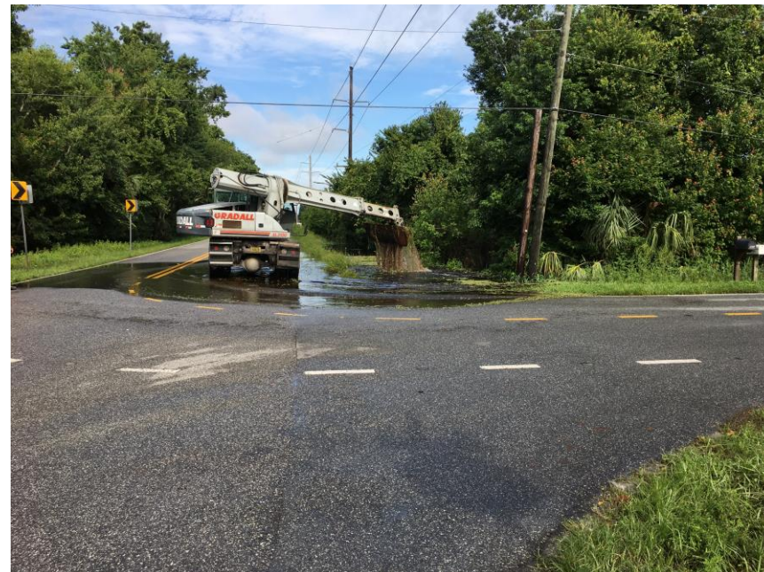
Flooding at Old Mims/Jungle Rd. looking West