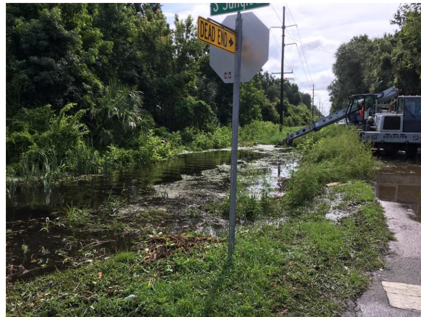
Flooding at Old Mims/Jungle Rd. looking East