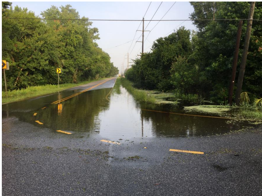
Flooding at Old Mims/Jungle Rd. looking West